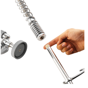
Step 2: Apply plumber's tape to top of riser threads and attach to spring assembly. Tighten with wrench.