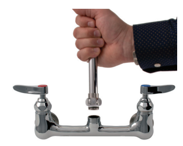
Step 4: Grab riser assembly and lower the EasyInstall® endfitting into faucet body. Press down until the endfitting "pops" in.