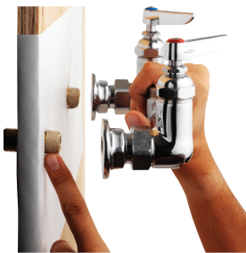
Step 1: Apply plumber's putty to backside of body and insert into mounting hole. Line up water supply lines and couplings, attach and tighten with wrench.

CHECKED: JRM 06-28-19 APPROVED: JHB 07-19-19