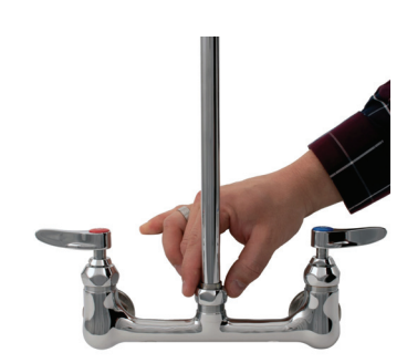
Step 5: Lock the EasyInstall® locking nut in place and tighten with wrench.